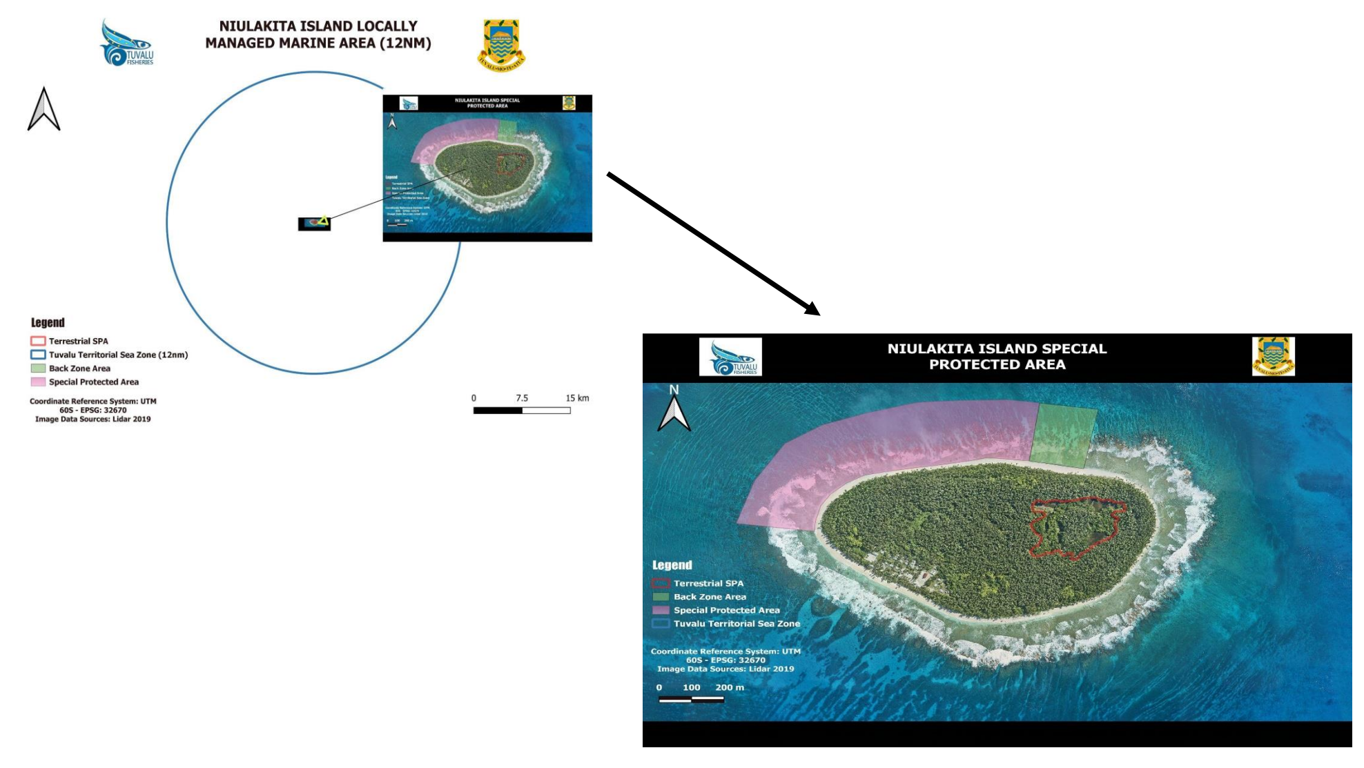
Figure 1. Map of Niulakita