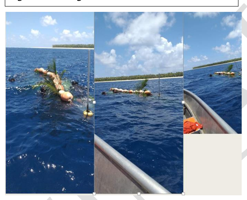
Figure 1: Nanumaga FADs

On the 25<sup>th</sup> September 2021, 3 TFD officers assessed the FAD and aggregated (2 officers from Coastal and 1 officer from Operation and Development) with FAD coordinates Latitude 06'16.649' S / Lattitude 176'18.679' E. the team aggregated the FAD with coconut leaves, this allowed small fishes to protect themselves by sheltering under those coconut leaves. Thus, attracted big fishes into the FAD. After aggregating the FAD, the team dived down about 40 meters depth to check the main line to the anchor. As a result the main line was still in good conditions.