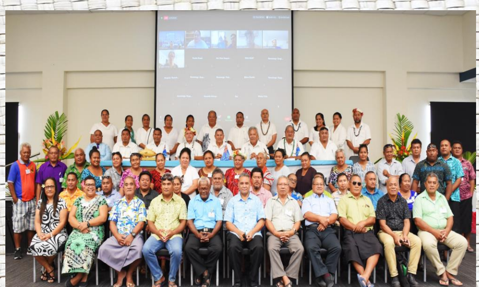
Figure 2: Group photo of the National Summit on Sustainable Development, 5th November 2020